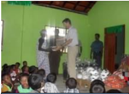
Management team at Periyaparanthan