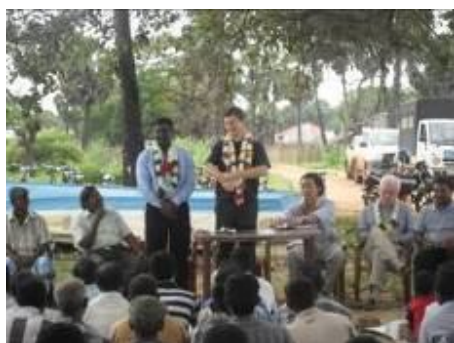
Resident Representative & Country Director at Kallappdu

All identified projects were channeled through the district review board 1 for their approval. Internally, the UNDP programme management unit (PMU) in Colombo approves the projects before submitting to the DRB. During 2010, 2 DRB meetings in Kilinochchi and 3 DRB meetings in Mullaitivu districts were called up to approve 20 GN level sub project proposals and 8 more district/divisional level proposals (Ice plant in Mullaitivu, support to District Agriculture Training Centre –Mullaitivu, Fisheries project -Kilinochchi, 4 proposals