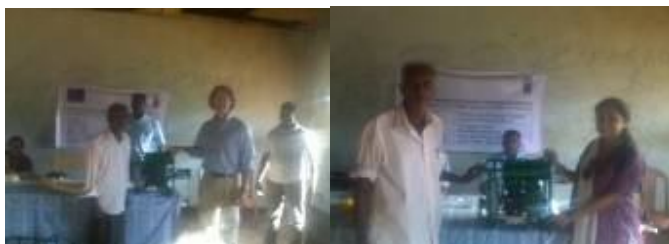
Country director & deputy country director (programme) at Indupuram

over of agriculture inputs to the Farmers in Periyaparanthan and Mulliyawalai. Also, he spent some time with Periyaparanthan preschool children.