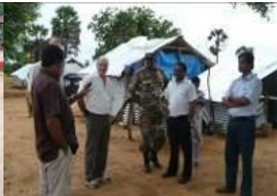
CIDA mission at Kokulai

In December 2010, representatives from CIDA and Norway embassy visited Mullaitivu. The CIDA mission met GA, Mullaitivu and visited Kokulai. The main objective of their visit is to identify opportunities for