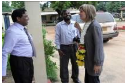
Mullaitivu GA welcomes the Norway ambassador

appreciated the team spirit and hard work.