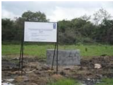
Thunukkai Community well - construction