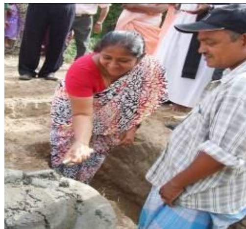
Kilinochchi GA laying the foundation for a preschool at Uruthirapuram East

The community infrastructures which are prioritized by the community have been selected for construction, reconstruction or renovation. UNDP follows two approaches in the infrastructure construction or renovation. One approach is to implement through civil work contractors and the other is through CBOs. CBOs with past experience were selected for construction/renovation works and were also provide with on the job trainings and close supervision.