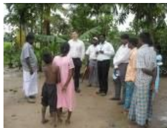
Resident representative at Pramandanaru

The Resident representative and country director made the last mission for the year 2010 in December. They participated in handing over some livelihood inputs and had discussion with several