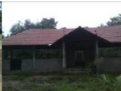
Uruthipuram Preschool - Construction