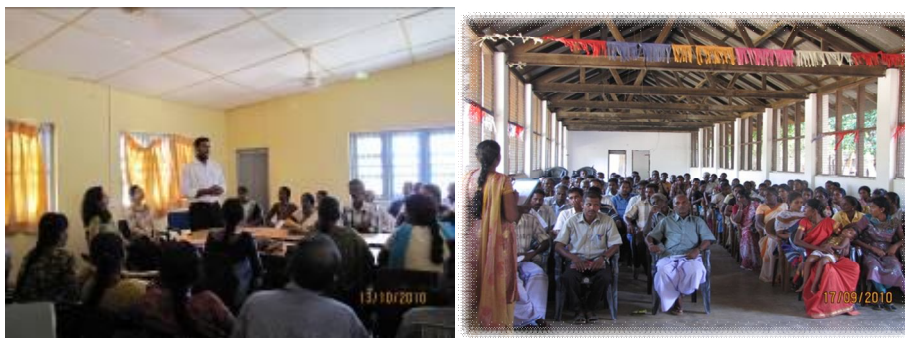
Awareness workshop to CBOs