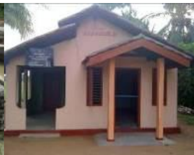
Periyaparanthan Multipurpose hall - Renovation