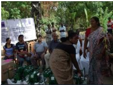
GA –Kilinochchi handing over the livelihood inputs to a beneficiary

A household survey was conducted to identify the baseline of each household in the focal villages and identified their livelihood need, based on the past experience, their potential time & labour, marketability of the product/ service and availability of the resources. To prioritize the most vulnerable households for livelihood intervention, a set of selection criteria was formulated.