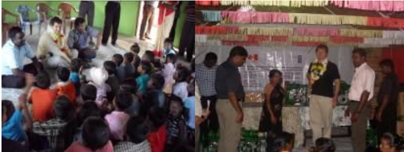
Resident representative at Periyaparanthan