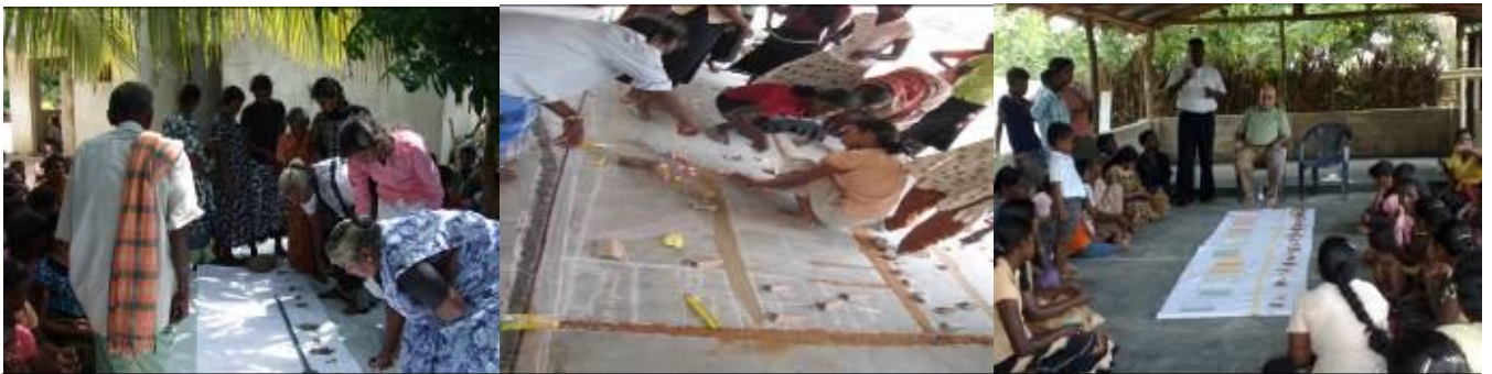
PCNAs in different communities

Proposals were developed through the findings of PCNA. PCNA reports were shared through UNOCHA to all the other agencies to fulfill the identified needs that were not addressed by UNDP.