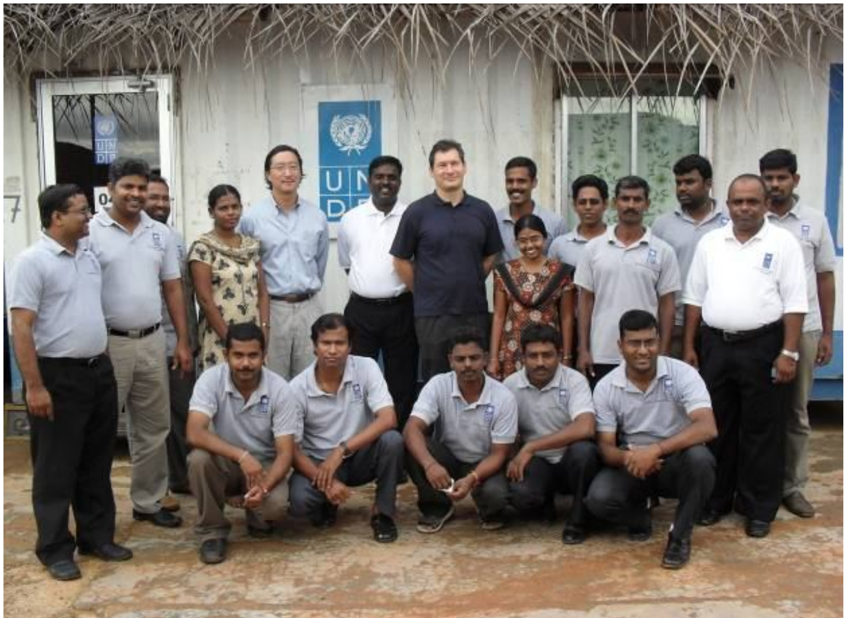
Our Team with Country Director & Resident Representative