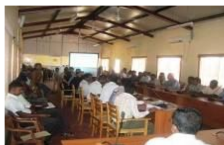
ER coordination meeting at Kilinochchi