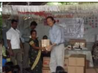
Country Director at Mulliyawalai west