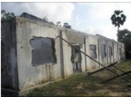
Pulopalai Coir factory – Renovation being done

The micro-credit support was prioritized by community in order to establish a fund source which would enable the access to vulnerable communities. In 2010, UNDP chose two modalities for micro-credit. UNDP transferred the grant directly to community level CBO where that particular CBO revolves the funds to the clients. The other modality is through a district/divisional level CBOs' federation where they disburse it to the relevant CBO.