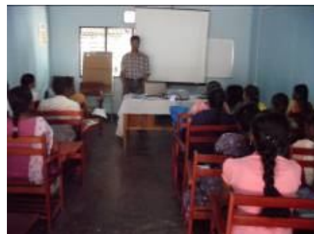
Sharing and support day to QAMs