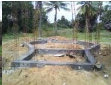
Tharmakkeni Preschool - Foundation