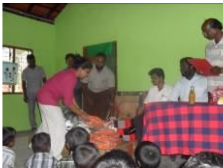
Distribution of sports equipment to Periyaparanthan youth club