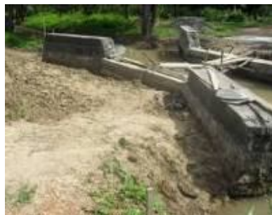
Uruthipuram Box culvert - Construction