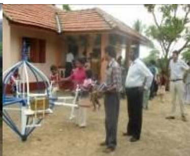
Periyaparanthan Preschool - Renovation