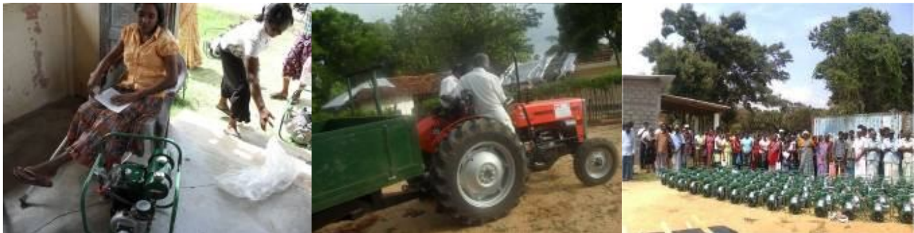
Provision of livelihood inputs to beneficiaries and farmers' organizations